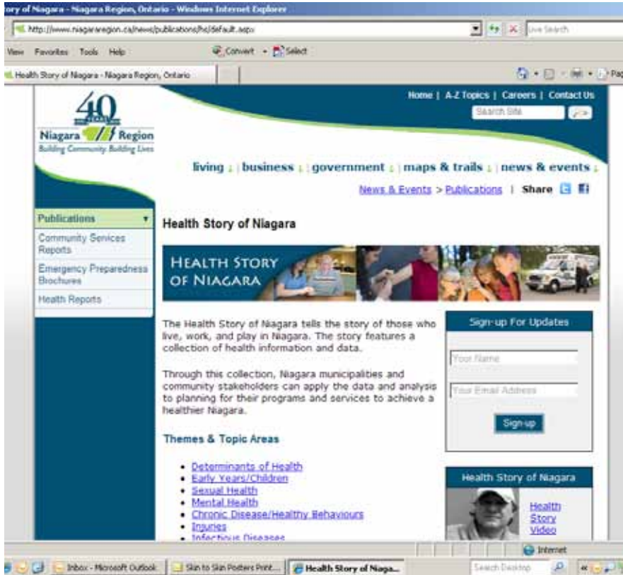
Health Story of Niagara Home Page:

We are committed to keeping you informed about the Niagara community and sharing information on Niagara's unique health attributes and experiences. The Health Story of Niagara website is designed to feature health information on local municipalities, as well as data and updates on various theme areas: