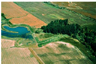
Figure 3.7 - REGIONAL MUNICIPALITY OF NIAGARA - Forested Cover from Regional Niagara Policy Plan