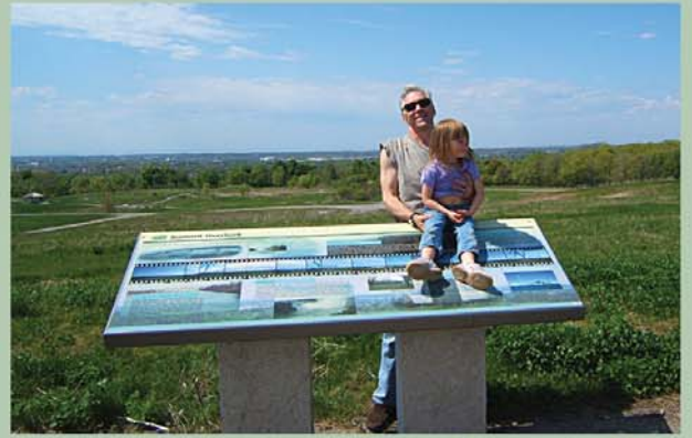
Interpretive Panel at the Summit Overlook

The Bruce Trail is the oldest and longest marked hiking trail in Canada, measuring over 800 km long. The Trail is a continuous footpath from Niagara to Tobermory along the Niagara Escarpment, a UNESCO designated World Biosphere Reserve. The establishment of the Bruce Trail plays a crucial role in protecting one of Canada's most important natural environments by providing an opportunity to explore the Niagara Escarpment in a sensitive manner. See the Bruce Trail Link sign at the Escarpment Overlook for more information.