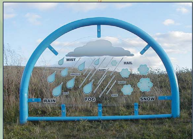
Precipitation Arch at the Children's Science and Nature Area

Welcome to the Glenridge Quarry Naturalization Site! We encourage you to take some time to wander through this unique and lovely place. Just a few years ago, this site was an active municipal landfill. With the input of many involved community residents and support from Niagara Region, the landfill was transformed into Niagara's Central Park.