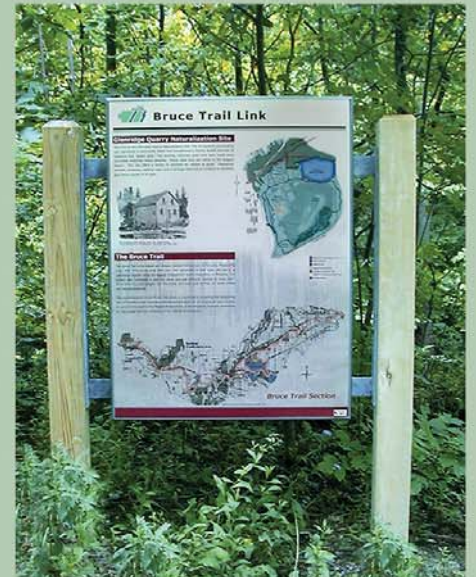
Interpretive Panel located at the Bruce Trail Link