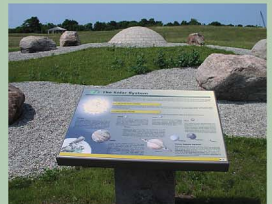
Interpretive Panel at the Children's Science and Nature Area

If you would like more information about the Glenridge Quarry Naturalization Site, visit www.regional.niagara.on.ca or phone the Niagara Region Waste Info Line at 1-800-594-5542.