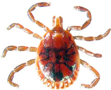
Male Lone Star Tick