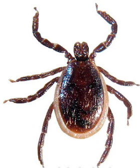
Male Blacklegged/Deer Tick