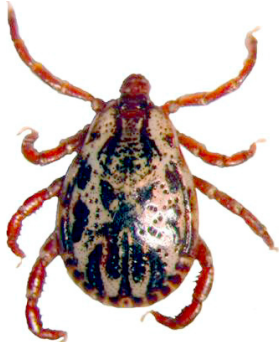
Male American Dog Tick