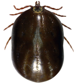
Engorged American Dog Tick