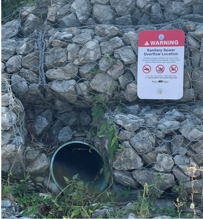
Figure SD-C- 2 - Image of Sanitary Sewer Overflow Public Signage